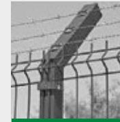
45 ANGLD EXTENSION (OPTIONAL)