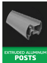
EXTRUDED ALUMINUM POSTS