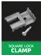
SQUARE LOCK CLAMP